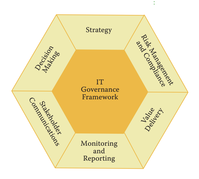
In particular organizations should seek an offering that allows for unified governance over a widely distributed system.

"Web 2.0" tools. Thus enterprise collaboration software comes under increased scrutiny in terms of governance support.